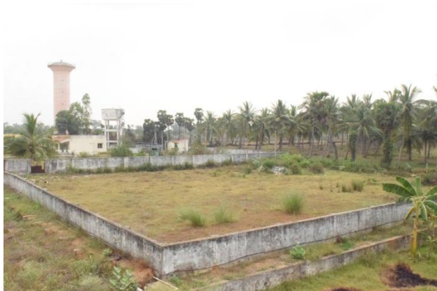
Temple Land beside Campus Challenge