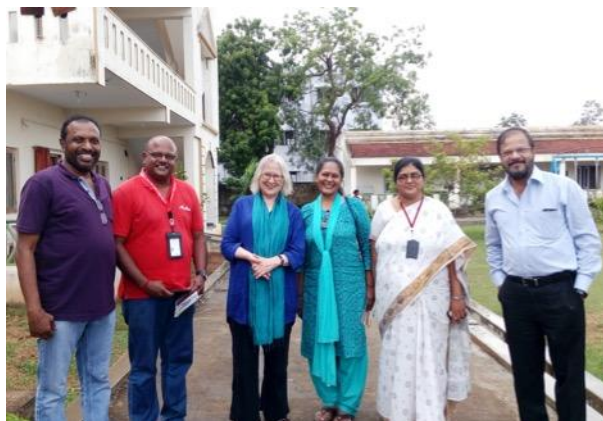
Air Asia people visit to Campus Challenge