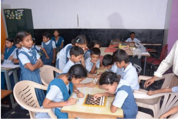
Children practising chess at Campus