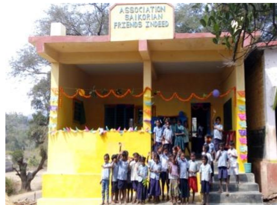
School Inauguration at Muliaguda