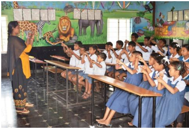
Special children Class