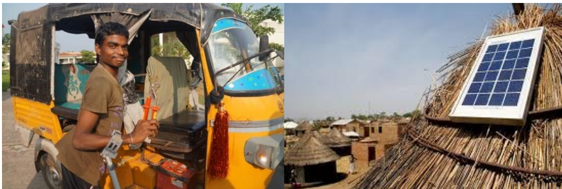
The future: a tuk tuk workshop