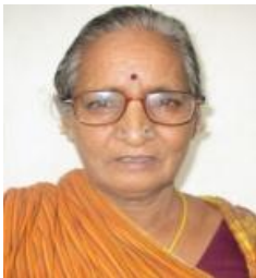
Appalanasamma Home-5 (Girls)