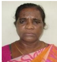
P Appayamma Home-6 (Boys)