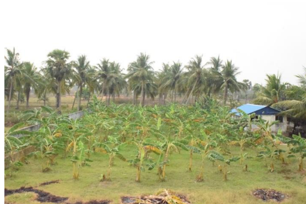
Banana Garden at Campus Challenge

The temple land, we hired from the villagers to cultivate vegetables for Campus. We have cleared the weeds and flattened. In the coming rainy season we cultivate vegetables. The land is suitable for growing Tomatoes, Brinjals, Bottle guard, Lady Fingers and Beans etc.,. The banana garden is located beside Medical centre; we have cultivated Bananas for campus. We are using raw bananas as vegetable. The gardens yields good crop and we used raw bananas once in a week. Next year we need to replace some Banana plants with new ones and also planning to plant some papaya plants. The Gardener Mr. Appanna will take care of this Banana garden regularly.