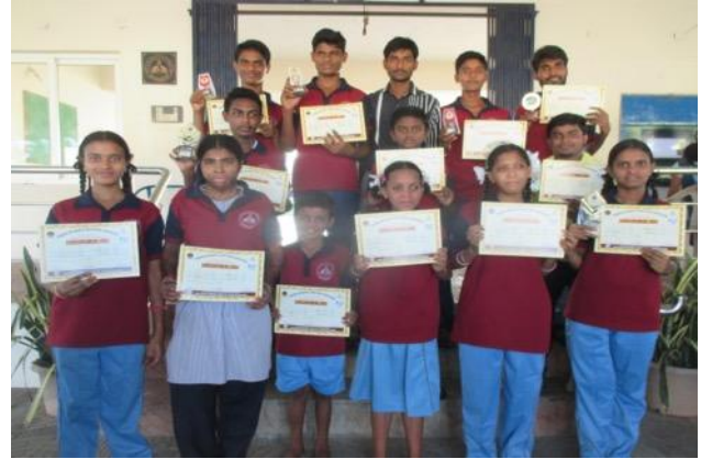
Achieved medals in chess tournament