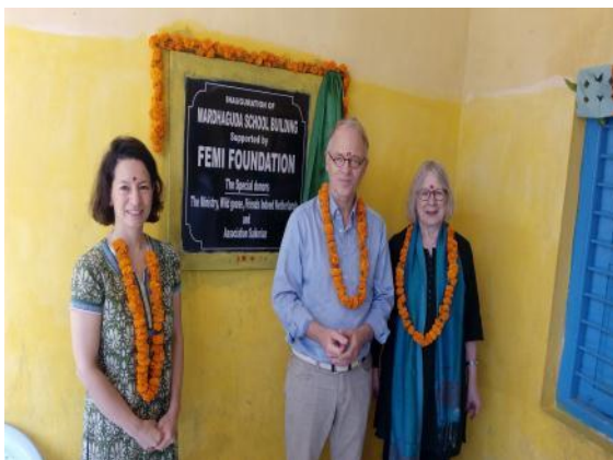
Mardhaguda School Constructed by FEMI