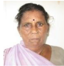
T Mutyalamma Home-4 (Girls)