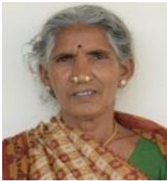
N Butchemma Home-1 (Youth)