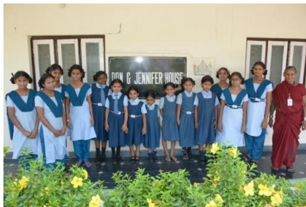
Children at Home