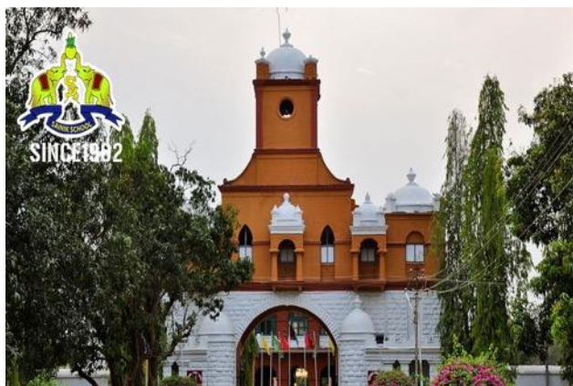
The Sainik School at Vizianagaram