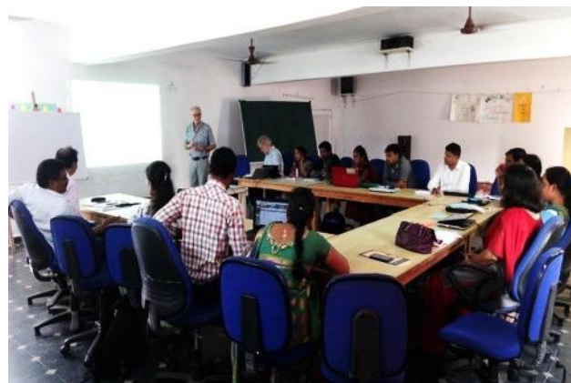
EDUKANS program at Campus Challenge