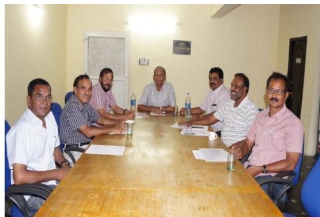
the Board of the Vizag chapter

Let us also tell something about us. Association Saikorian (AS) are the alumni of the Sainik school, Vizianagaram and we are active in social work since 2003, when the first home of AS the Krushi Home for former street boys at Medchal (Hyderabad) was constructed, in collaboration with Friends Indeed. The Hyderabad chapter is doing a great job there, everyday active in seeing to it the boys feel at home, go to school and find a job!