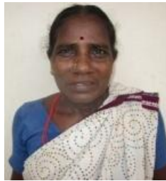
Appalanasara Home-2 (Girls)