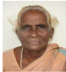
D Ramjan Home-3 (Girls)