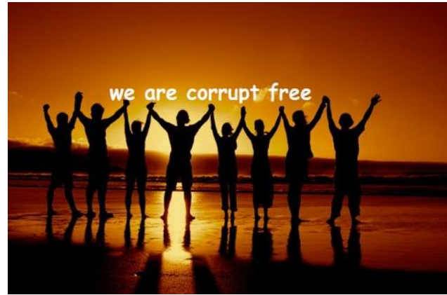
Campus Challenge Corrupt Free!