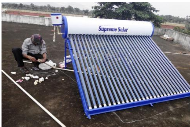
Solar water heater installation